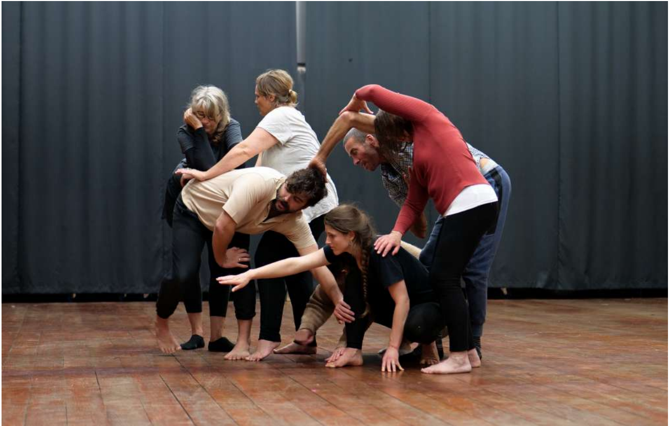
Play It Forward Programme July 2023