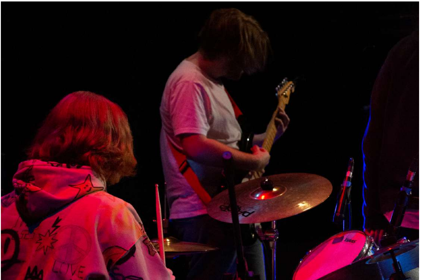
Emerging Musicians Programme: WBHS Band Ready Set Performing at ONEONESIX May 2023

This programme, jointly funded by NZ Music Commission, DIA COGS Fund, and ONEONESIX, is working with 3 cohorts of emerging musicians. The musicians from both Whangārei and Te Taitokerau will participate in a series of capability building workshops (song writing, vocal techniques, sound checking, stagecraft, promotion etc.) culminating in a live public performance. Following on from each cohort's live performance they will receive mentoring from established musicians as they move along a pathway of gigs and recording. We hope that this will create context for emerging musicians to undertake a professional musical career. We also expect that this programme will build peer relationships between the musicians giving them an additional layer of support.