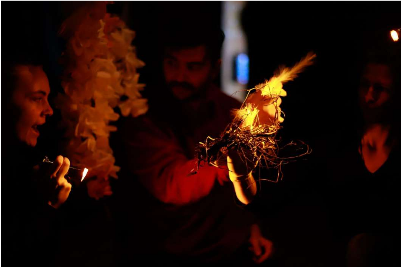
Company of Giants: The Living Forest (Whangārei Professional Theatre Company) October 2022

This year also saw the first fully te reo performance produced by Northland Youth Theatre and Ngā Hua Toi, which saw a sold out season of 5 performances playing to kura from around the rohe as well as to an engaged local audience. The season proved there is a strong demand for te reo theatre in Whangārei. ONEONESIX subsidised the venue hire, and our staff and board were fully involved in the technical design (set, sound and lighting), production, stage management and promotion of the season.