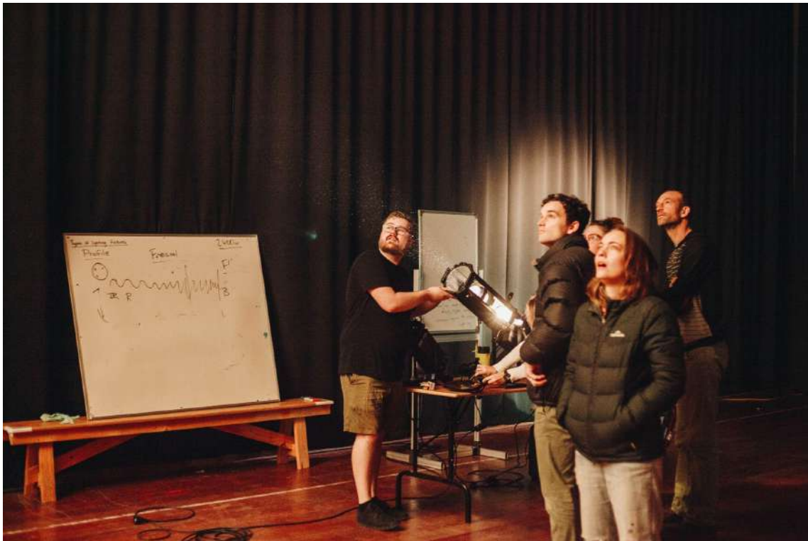
Tai Tokerau artist capacity building workshops: Lighting Workshop April 2023

This programme, jointly funded by the WDC Community Fund, ONEONESIX and Whangārei Fringe, will increase the capacity of performing arts practitioners within our region so that Te Tai Tokerau has a thriving performing arts framework where strong contemporary work is being generated and presented regularly. This is the next step in creating professional development opportunities to support new and original theatre and performance making and to support risk taking in performing arts in our region as well as striving to make strong work that has a clear original voice. We also recognise that in order for the festival programme to deepen and grow in terms of the quality and depth of local content, we must provide support for artists who haven't yet participated in WFF to connect, develop skills and build original work in connection to their community.