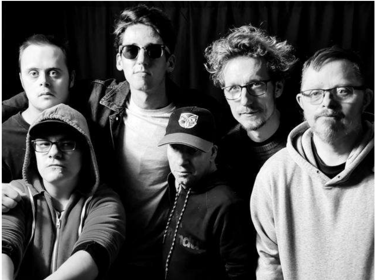
Mutes (from Mars): Neurodiverse rock band performed at ONEONESIX March 2023

Our volunteer base remains strong and ONEONESIX could not function without the 1,800+ hours of volunteer time people give each year. Fringe was staffed by over 70 volunteers, many of whom continue to be part of the ONEONESIX volunteer community. Our technical manager trained 15 volunteers of diverse age and backgrounds to operate the performances at ONEONESIX and the other Fringe venues. A significant number of the Fringe volunteers are existing ONEONESIX volunteers and the additional skills they learned during Fringe have solidified our front of house systems and performance support.